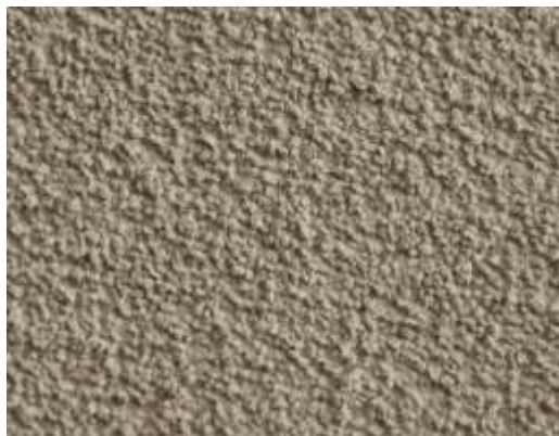
BARANEK 1,5 mm