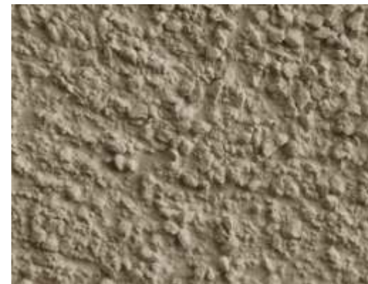
BARANEK 3,0 mm