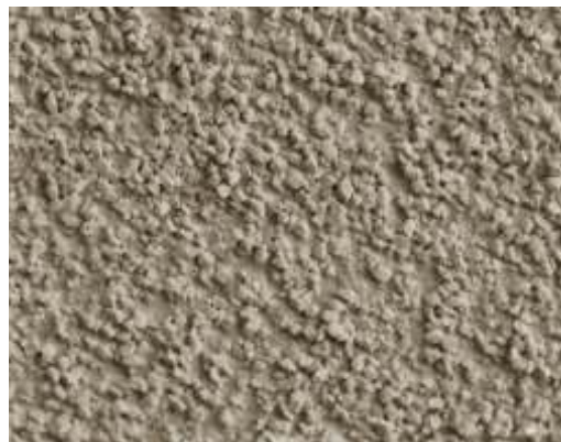
BARANEK 2,0 mm