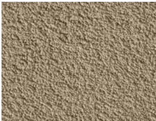
BARANEK 1,0 mm