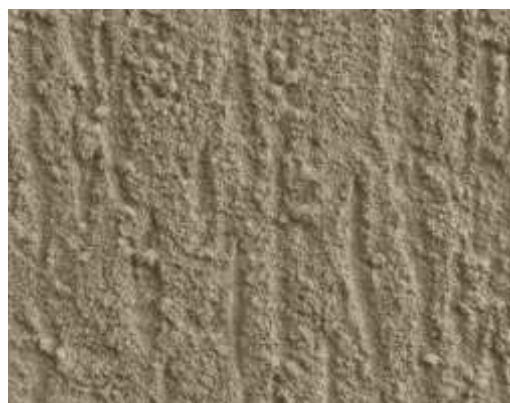
DRAPANA 2,0 mm