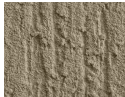
DRAPANA 3,0 mm